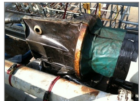
EPC Flange Bag

Corporate Office | 7887 FM 2004 Hitchcock, TX 77563 | Ph: 1.855.827.4845 | info@fsi-us.com CA.-License # 923444 | LA.-License # 41609